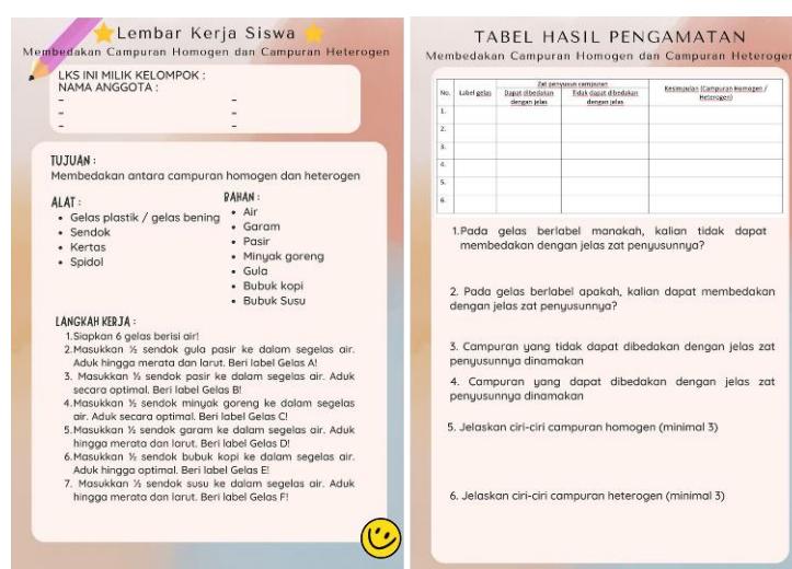
Figure 2. Student practice module.

To improve students' memory, students are given the task of doing a practicum in groups of 5-6 people. Students are asked to make several mixed solutions and group these solutions into homogeneous mixtures or heterogeneous mixtures. This practicum uses a project-based learning model. The project-based learning model is learning to build students' knowledge and understanding based on their experiences through presentations. For the learning objectives to be achieved and the practical activities to be successful, students are given a practice module to observe first, as shown in Figure 2 . This practice module includes titles, objectives, tools and materials, work steps, and tables of observations.