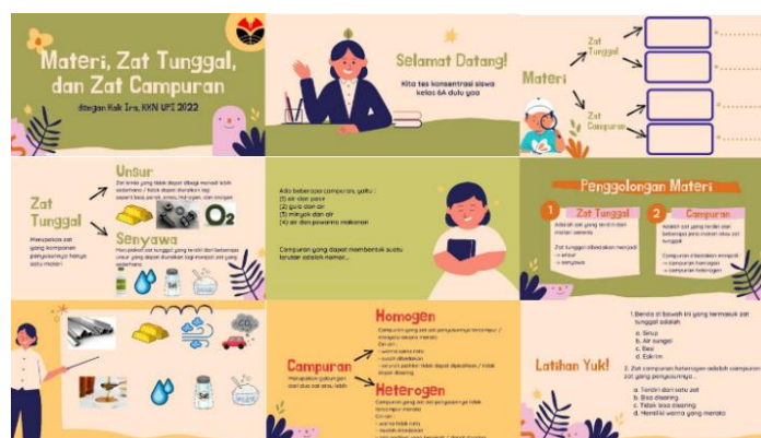
Figure 1. Learning using PowerPoint media is interesting and interactive.

When learning, students are given material about objects, elements, compounds, and mixtures with a discovery-based learning model using interesting and interactive powerpoints as shown in Figure 1 . The use of interactive PowerPoint can foster student curiosity and increase student learning activities. Discovery learning is a type of learning where students experiment and cover a principle from the experiment so that students can build their knowledge. This learning is carried out for 1.5 hours of lessons.