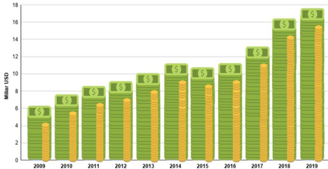
Figure 2. Indonesia's tourism foreign exchange earnings adopted from Permatasari and Esquivias (2022) .

economic, cultural, and political fields, as well as the integration of various economic elements. The programme emphasises the importance of tourism in driving national development, one of which is by increasing state revenue and community welfare.