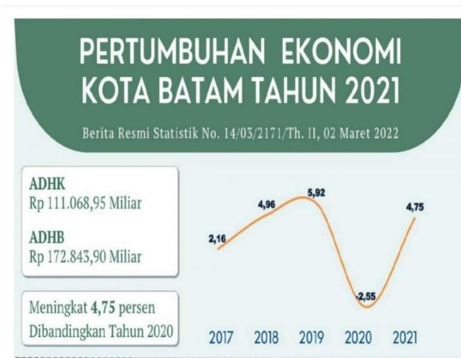
Figure 4. Economic growth of Batam city in 2021 adopted from Angela (2021) .

Batam City is strategically located in the coastal region of Indonesia and geographically adjacent to Singapore. The geographical proximity can benefit Batam. Thus, it becomes the centre of industry and investment. Thus, Batam is currently growing rapidly in the economic sector through industry and investment. The Batam Concession Agency has issued various policies to boost the regional economy. One of them is the existence of a free trade area that can attract investors and economic actors. In the International Tax Glossary 2015, FTZ refers to an area of a country that does not impose taxes on goods imported into the area. Therefore, we believe economic players and investors benefit from the introduction of Batam as a free trade zone. Batam's strategic location makes it a prime area for international trade activities, as its location right next to Singapore and close to the Strait of Malacca makes it a partner for international trade and investment transactions. Considering this possibility, the government then issued Government Regulation No. 26/2008 on the National Spatial Plan and National Strategic Areas, which helped develop Batam's economic advantages that investors are looking for (see Figure 5 ).